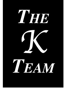
The K Team

OFFICE PRODUCTION Listing Units 7 Sales Units 9 Listing Volume 1,324,200 Sales Volume 1,814,900