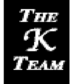
The K Team